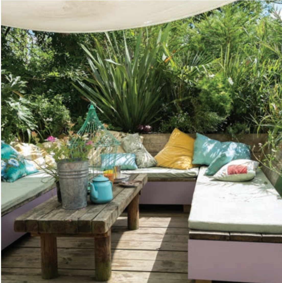
Bench: Brassica® No.271 Exterior Eggshell.