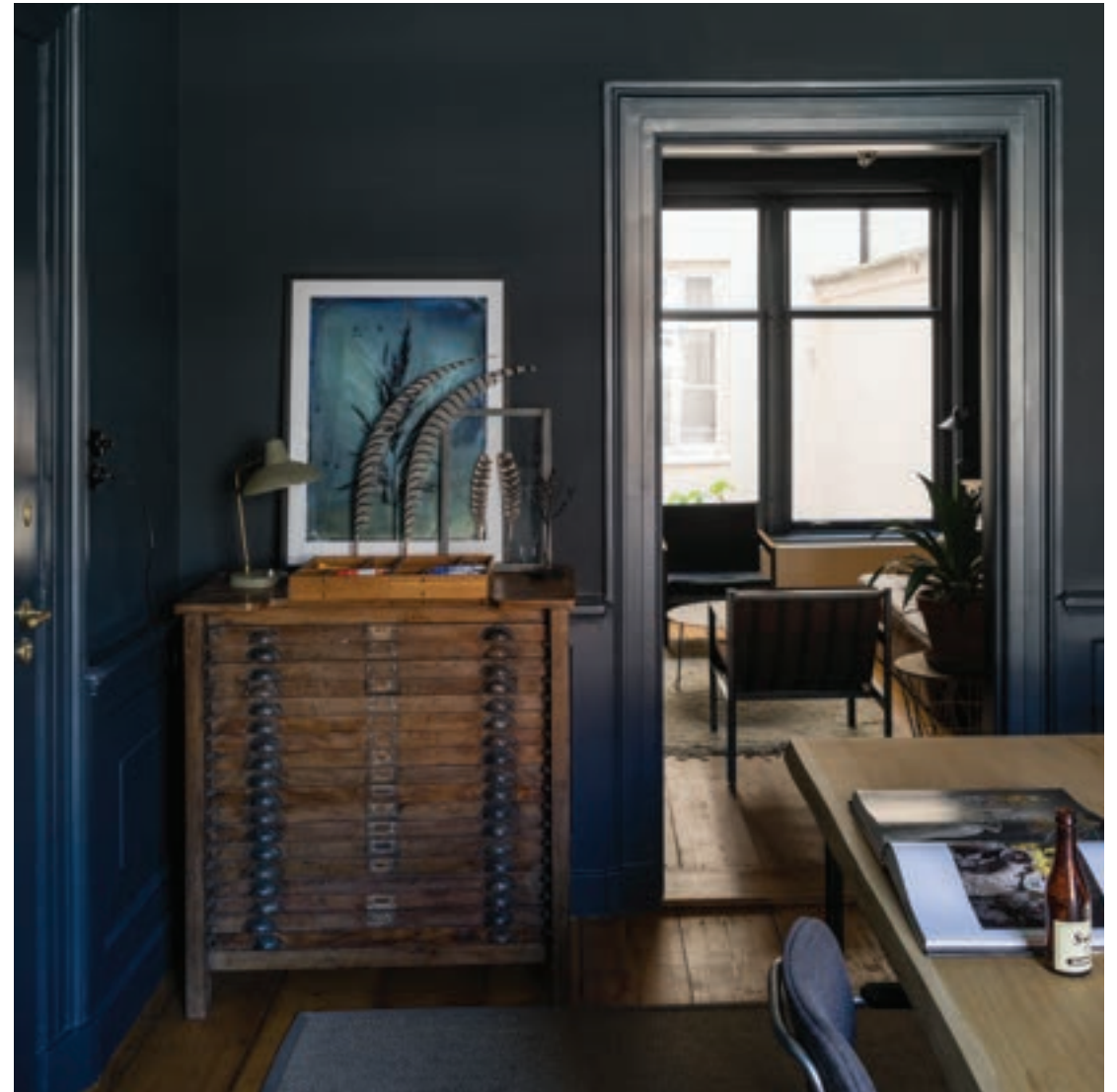
Walls: Railings™ No.31 Dead Flat. Woodwork: Railings™ No.31 Estate® Eggshell.

Limewash: A historical finish for walls and ceilings, both inside and out, Limewash bonds to the building itself to protect your home from the elements. Professional application recommended.