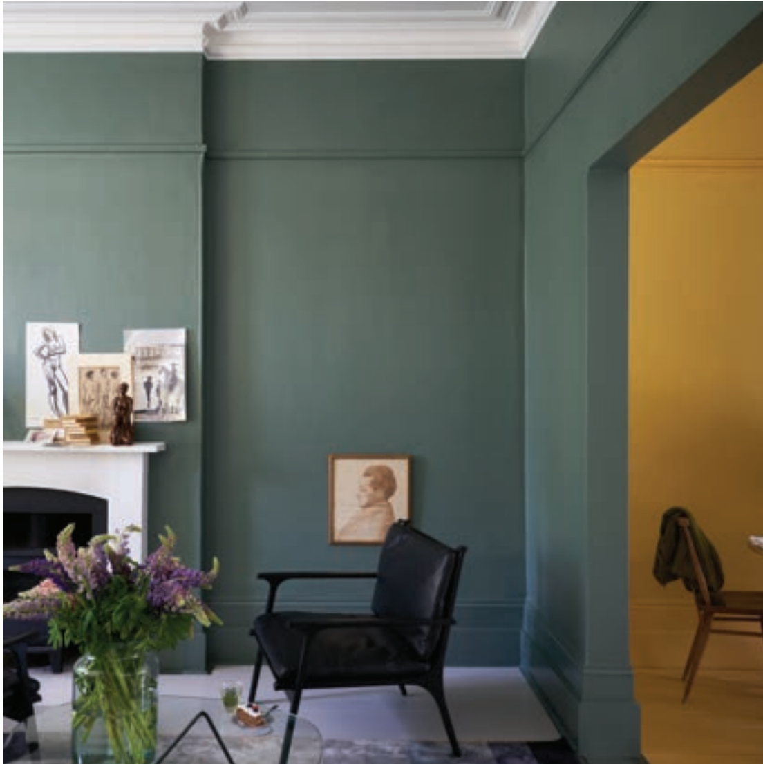
Ceiling: Wimborne White® No.239 Estate® Emulsion, Walls: Green Smoke® No.47 Estate® Emulsion, Woodwork: Green Smoke® No.47 Estate® Eggshell.