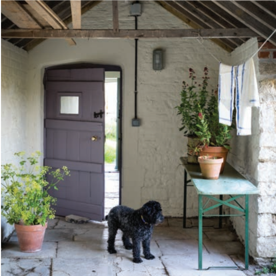
Walls: Joa's White® No.226 Exterior Masonry, Door: Brassica® No.271 Exterior Eggshell.