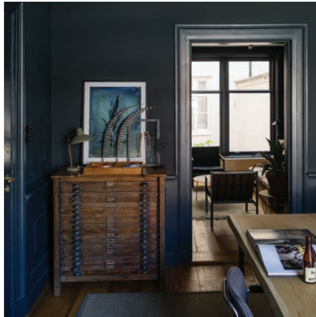
Walls: Railings™ No.31 Dead Flat, Woodwork: Railings™ No.31 Estate® Eggshell.

Limewash: A historical finish for walls and ceilings, both inside and out, Limewash bonds to the building itself to protect your home from the elements. Professional application recommended.