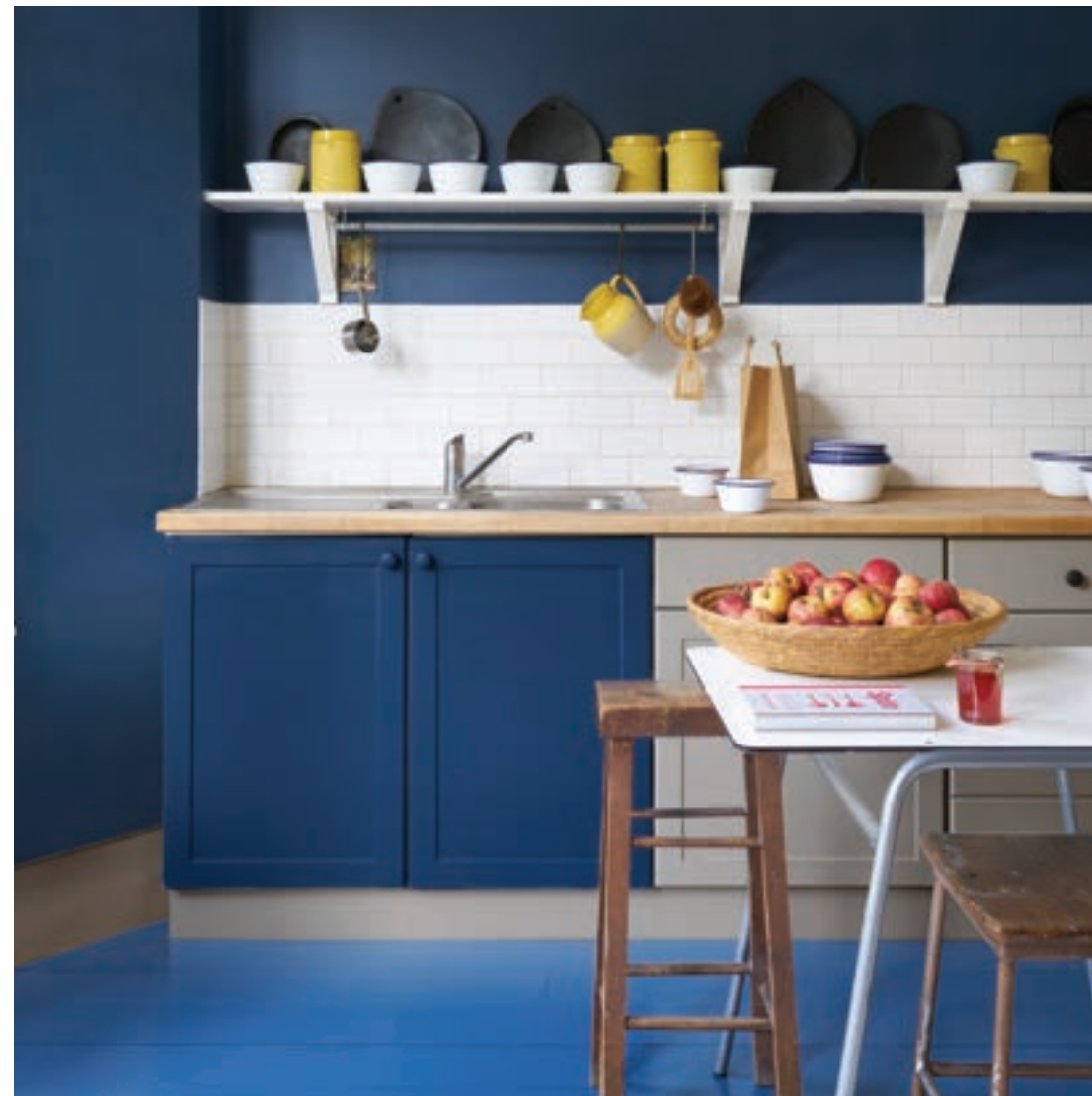
Walls: Stiffkey Blue® No.281 Modern Emulsion, Cabinets: Stiffkey Blue® No.281 and London Stone® No.6 Modern Eggshell, Floor: Stiffkey Blue® No.281 Modern Eggshell.

Modern Eggshell: The toughest product in our range, this mid sheen finish transforms kitchen cabinetry, floors and other hardworking interior wood or metal surfaces in your home with a subtle 40% sheen.